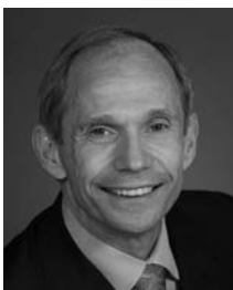
Charles T. Drevna President

Legislative efforts are also underway in the United States to amend the Chemical Facility Anti-Terrorism Standards (CFATS) to allow government officials to dictate which security measures facilities must employ. Maintaining and enhancing facility security has always been a top priority for our members, and NPRA will continue to advance the message that the owners and operators of chemical facilities already utilize the safest, most cost-effective and innovative technologies available.