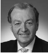
Donald Condon Westlake Chemical Corporation